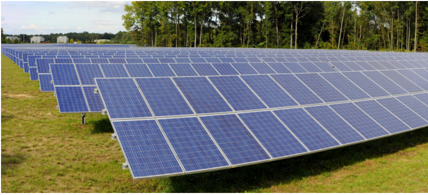
NextEra Energy Resources has approximately $7 billion of planned investments through 2014 across the U.S., Canada and Spain.